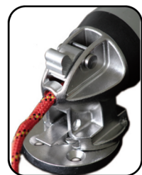
Integrated line stopper